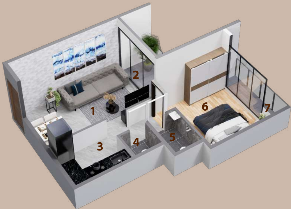
1 BHK Type A (X04-X08)

Regency Landmark is designed to provide its residents with a modern and comfortable lifestyle. The Building is equipped with all the latest amenities and facilities, including a Mini Gym, Clubhouse, children's play area and Security features like Video door phones and CCTVs. The Building offers a range of apartment configurations to suit the diverse needs of its residents. These configurations include 1 BHK and 2 BHK apartments.