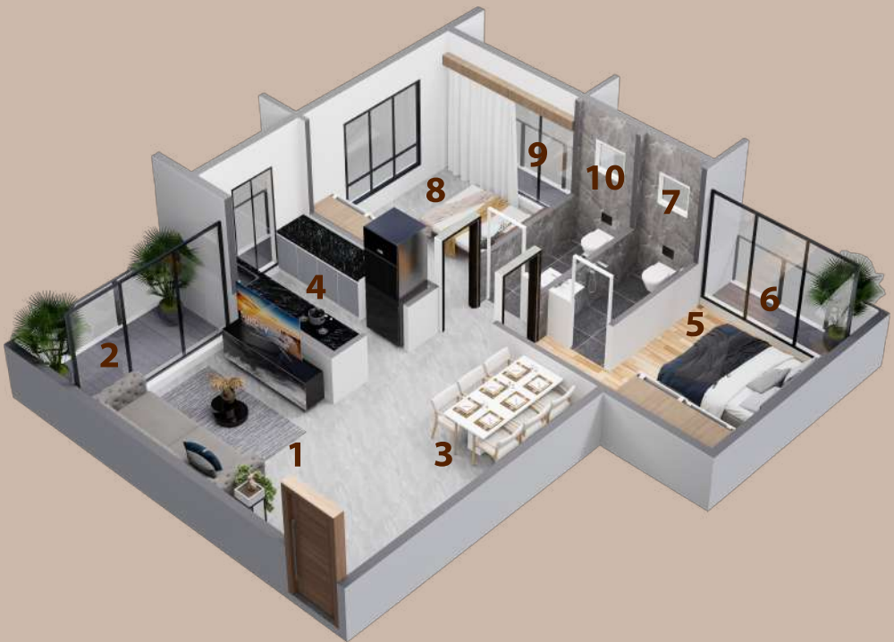
2 BHK Type A (X10)